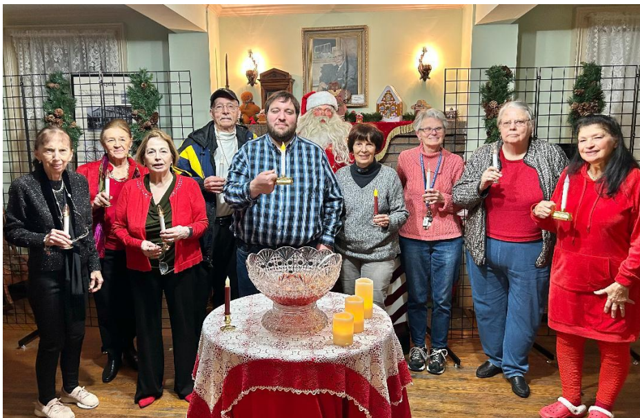
Candlelight at the Pagan Fletcher House